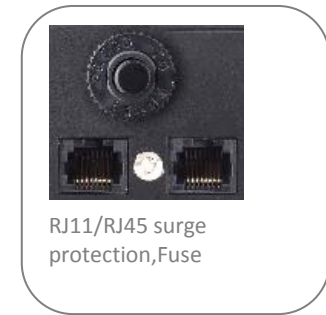
RJ11/RJ45 surge protection, Fuse